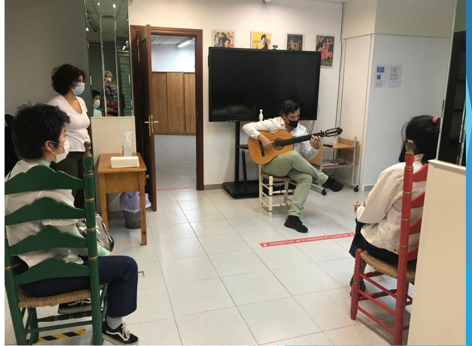
Students from Wellesley College at the PRESHCO program, November 2020