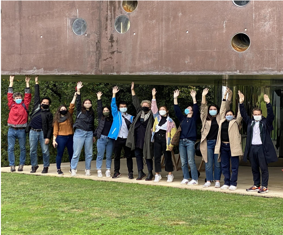
Students from Rice School of Architecture - Paris, November 2020